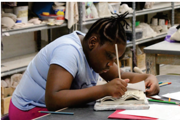
Poetry, Pottery, & Paper camper carves a poem into her clay book at Flower City Arts Center

Our Image Meets Word program, in partnership with the George Eastman Museum, continued to thrive in 2025. Fifth- and sixth-grade students from two Rochester City School District schools participated in a five-week visual and textual literacy experience, combining museum visits with instruction from Writers & Books teaching artists and professional photographers.