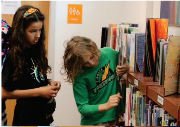
Campers attending It Could Happen Here, a SummerWrite in the Branches camp, explore the Lincoln Library