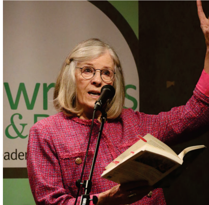
Mimi Kennedy reading from The Education of an Actress

Through our gift-economy ticket model for events and scholarship opportunities for every class, we work to ensure that high-quality creative writing education remains accessible to all. The depth and diversity of the authors and teaching artists we collaborate with reflect our ongoing commitment to inclusion and representation. We believe every person is a writer—even if they haven’t yet discovered it—and that every story has value, even if it hasn’t yet been told.