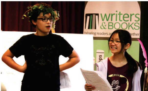
Percy Jackson's Magic Pen campers embody the Greek gods in an original performance for family and friends