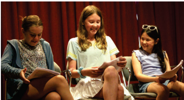
SummerWrite campers attending Write a Short Play, perform their original work for family and friends.

SummerWrite, our flagship youth program, serves children and teens—from reluctant readers to budding novelists. The program provides them with a welcoming environment where they experiment, collaborate, and grow. Across genres and formats, students develop confidence, make new friends, and tap into their creative instincts.